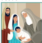
Simeon recognizes Jesus as who the Holy Spirit told him of and says he is like a light.