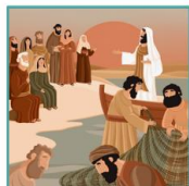
Jesus teaches a crowd of people from Simon Peter's boat.

LI: I know that the disciples encountered Jesus and knew that he was special