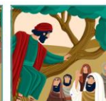
Jesus goes to meet Zacchaeus. He says he is going to his house for tea.