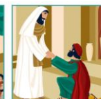
Zacchaeus changes. He promises to help people who are poor. Jesus says he is saved.

Zacchaeus tax collector crowd teacher Candlemas