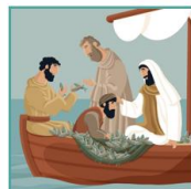
The fishermen are amazed. Jesus says, "Do not be afraid".