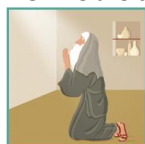
The Holy Spirit tells Simeon that he will see the Lord's Messiah.