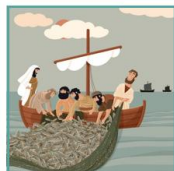
Jesus tells the fishermen to throw their nets into the lake. They are filled with fish.