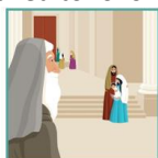
Simeon goes to the Temple and meets Mary, Joseph and Jesus.