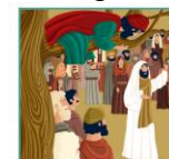
Zacchaeus climbs a tree so that he can see Jesus above the crowd.