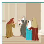
Anna recognizes Jesus as a special baby.

LI: I can imagine how some of the people who met Jesus felt