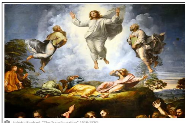
(photo: Raphael, "The Transfiguration", 1516-1520)

Describe accurately in sequence and detail what the disciples see at the Transfiguration, saying something about the importance of Moses and Elijah.